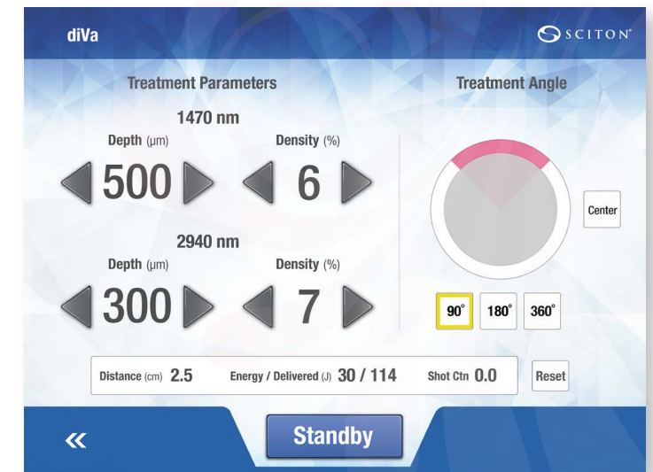
EASY TOUCH-SCREEN TREATMENT USER INTERFACE

diVa delivers both ablative and non-ablative wavelengths to the same microscopic treatment zone: 2940 nm for ablation and 1470 nm for coagulation. The 2940 nm wavelength is used to deliver 100 to 800 microns depth of ablation and the 1470 nm wavelength is used for delivering 200 to 700 microns depth of coagulation to the vaginal soft tissue. Choose each wavelength's parameters independently to create a unique synergistic effect.